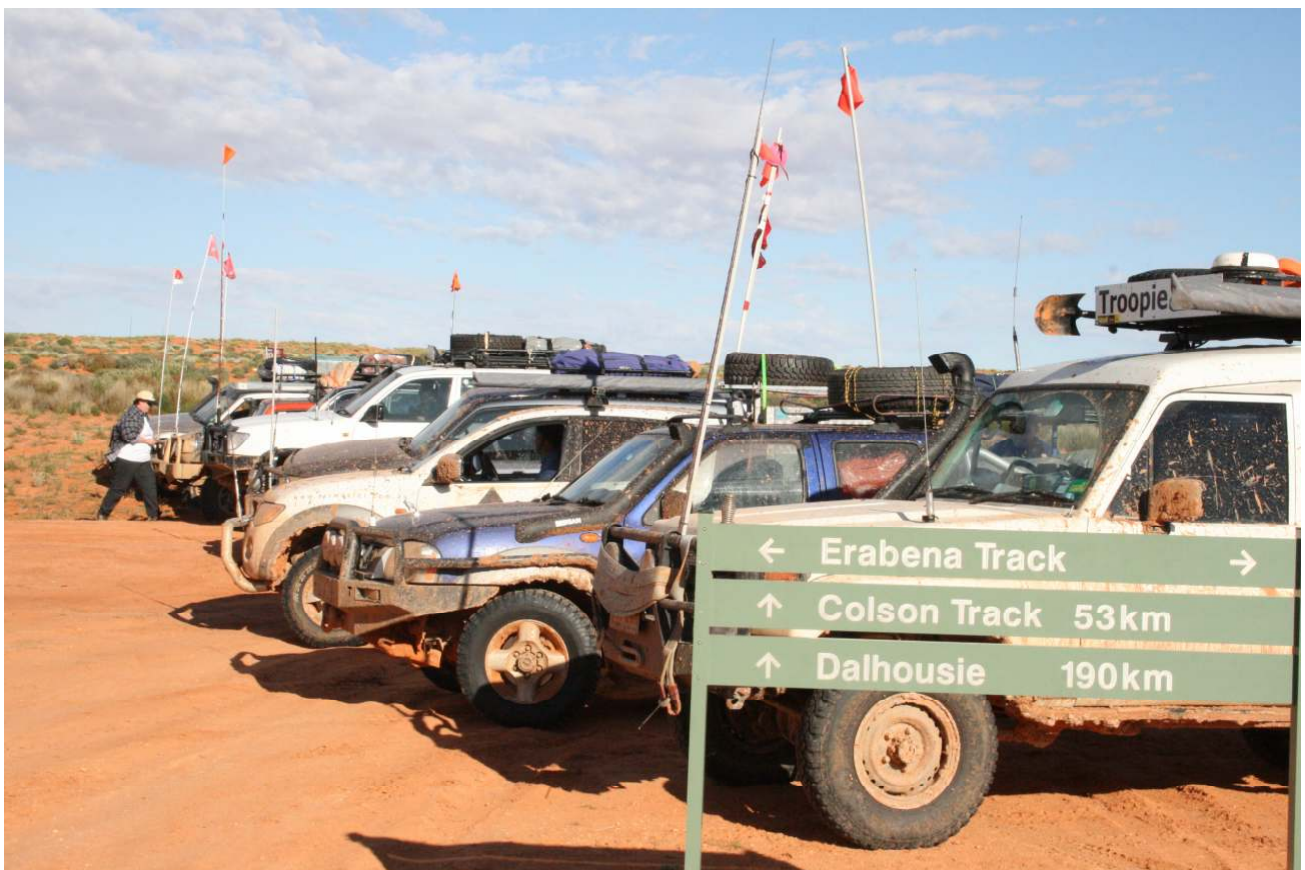
Simpson Desert car line up - Club Crossing August 2010