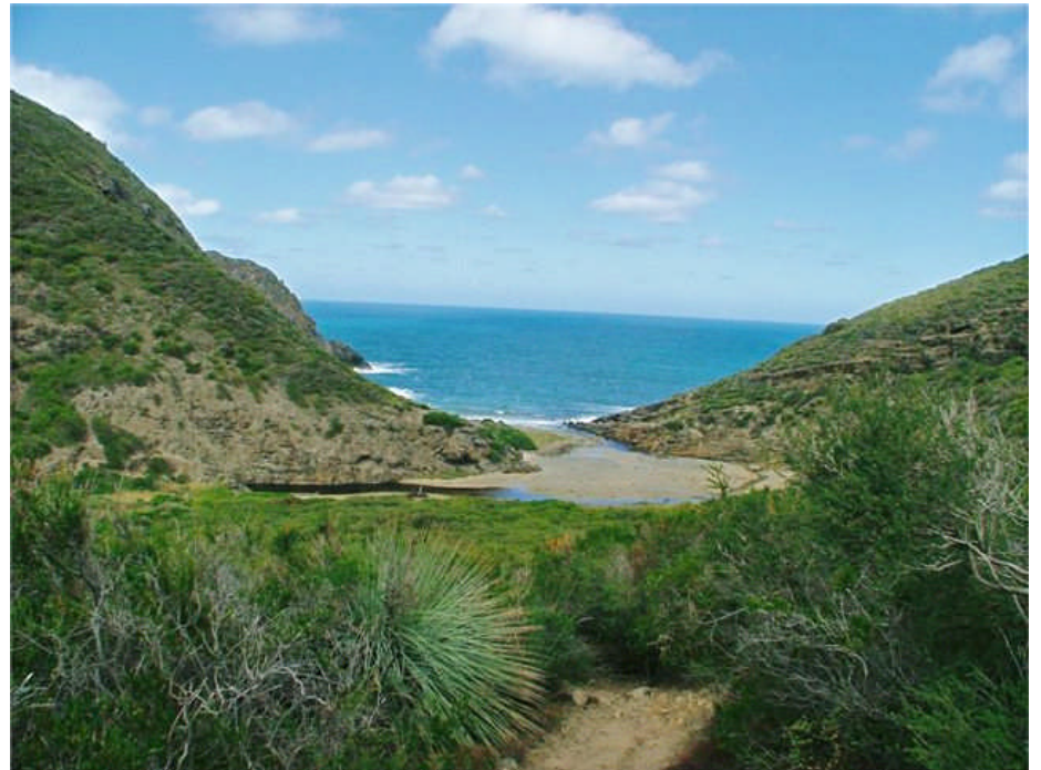
Top of lookout – Flinders Ranges Deep Creek Outlet – 7Km Hike