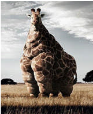
McDonalds reaches Africa

GENERAL MEETING PROGRESSIVE DINNER/CAR RALLY