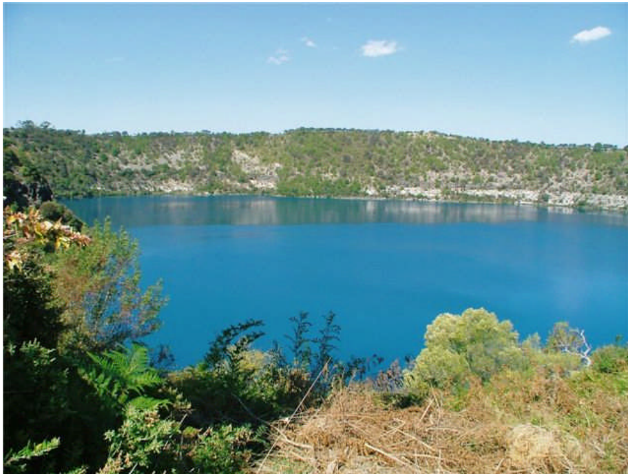
Storm – Broken Hill Blue Lake – Mt Gambier